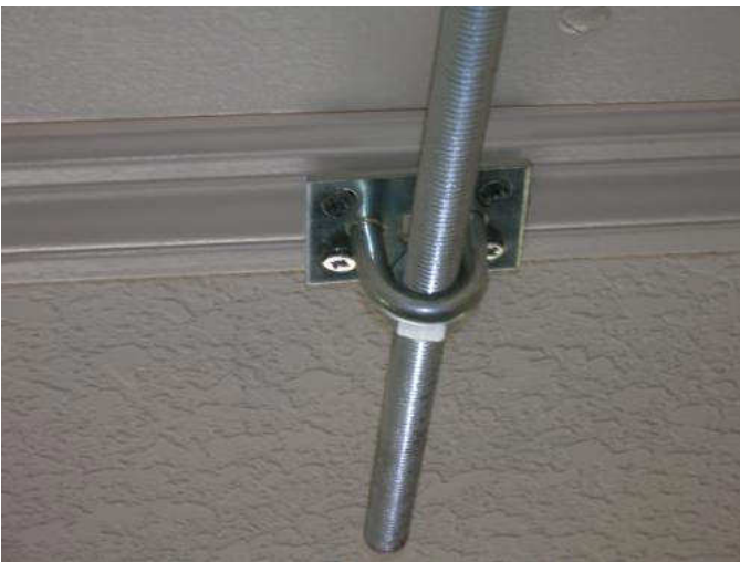
Secure the hasp into the frame work.