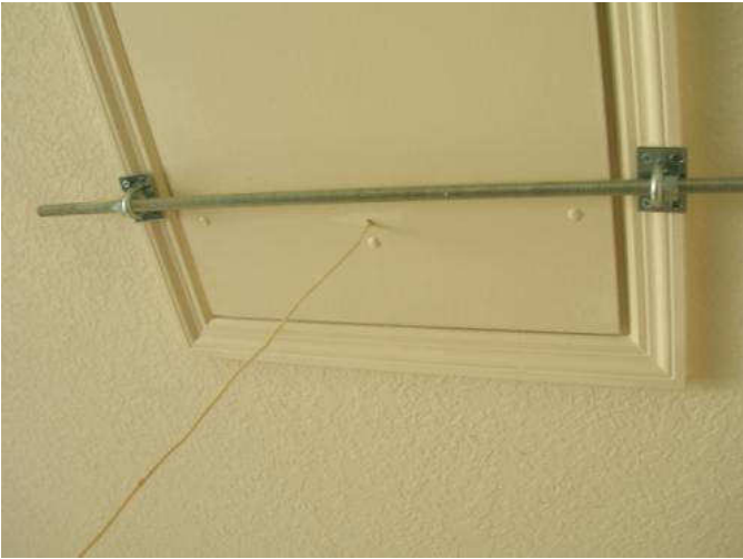
The bar keeps the door shut.