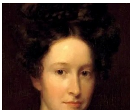
Figure 1: Emily Donelson

The role of first lady is traditionally filled by the president's spouse, other family members have stepped in several times in U.S. history. Though there's no constitutional requirement to have a first lady, it's always been the tradition, and in cases where the president has been widowed or unmarried, someone else has always filled the role. The first instance was Martha Jefferson Randolph, the eldest daughter of Thomas Jefferson. When Jefferson took office in 1801, he had been a widower for about 20 years, so Martha took on the first lady duties, which at the time largely entailed hosting social events. Future First Lady Dolley Madison also lent an unofficial hand during the Jefferson administration while her husband, James, was serving as secretary of state.